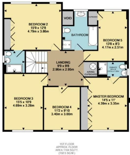
5 ORCHID CLOSE, BURE PARK, BICESTER, OX26 3WT TOTAL APPROX. FLOOR AREA 2250 SQ.FT. (209.0 SQ.M.)